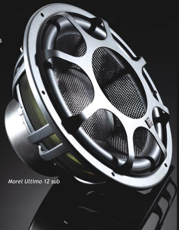
Morel Ultimo 12 sub